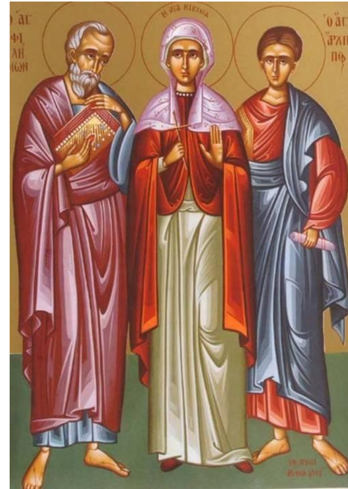
Ss PHILEMON, APPHIA AND ARCHIPPUS